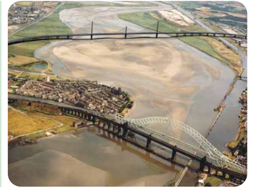
How the new bridge (top) will look next to the Silver Jubilee Bridge

The new bridge will be designed to carry up to six traffic lanes forming part of a new and improved high standard road (9.5km long) connecting north Widnes and Merseyside with Runcorn and the national motorway network in north Cheshire. Traffic would benefit from congestion free uninterrupted travel across the Mersey for the foreseeable future.